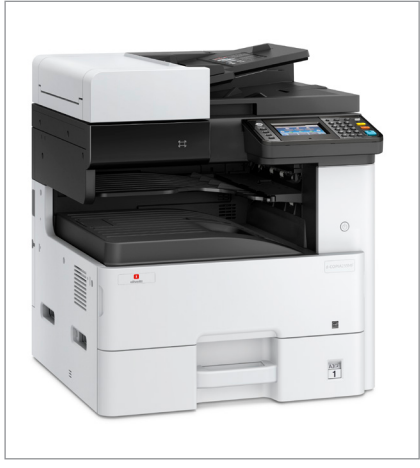
d-Copia 255MF in standard configuration